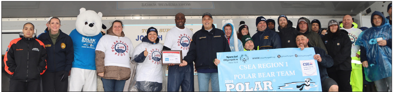
The CSEA Long Island Region Polar Plunge team is presented with a plaque, recognizing the group as the top fundraising team for the day.