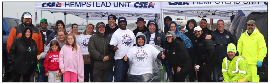
The CSEA Polar Plungers and their supporters.

A cold, rainy day didn't stop CSEA Long Island Region members from "freezin' for a reason" at the Town of Oyster Bay Polar Plunge. Region One raised more than $17,000 for Special Olympics New York athletes, making the CSEA Long Island Region the top fundraising team for the day. As it costs $400 per year to fund one athlete, the donations will put several athletes on the road to fulfilling their competitive goals.