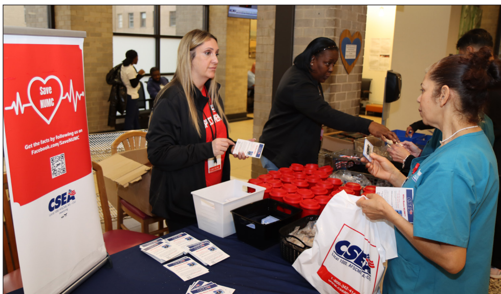
The CSEA NUMC Unit set up an informational table, which served as a setting to have conversations.

CSEA set up an information table at NUMC, where union activists held conversations with members about the misinformation they have been told by