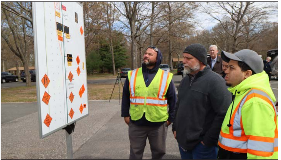
Members review a board that explains how to properly set up a construction zone.

WEST BABYLON — CSEA New York State Department of Transportation [D.O.T.] Local 508 members, joined other union members at the state's annual D.O.T. Safety Meeting. At the two-day event, members learned safety techniques and procedures that will help them safely and accurately complete their work.