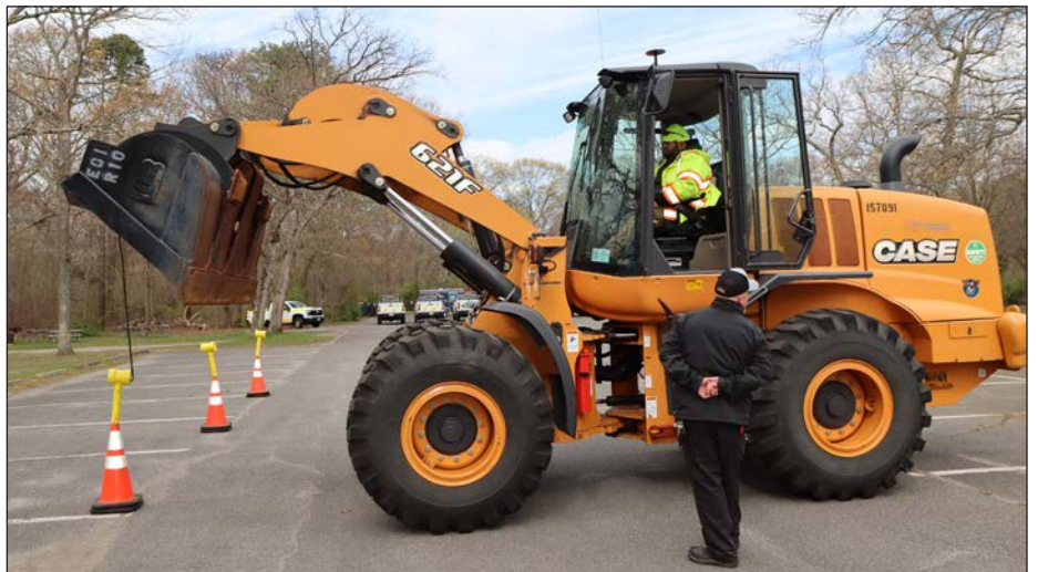
There was a special section at the conference for CSEA members to practice operating heavy equipment.